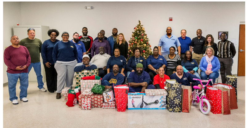
Union and Labor Relations representatives partnered to support the Salvation Army's Angel Tree program.