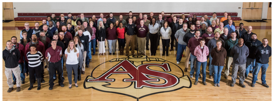
Apprentice School faculty and staff gathered in the school's gymnasium in honor of National Apprenticeship Week in November.

Last year, The Apprentice School was reaccredited through 2022.