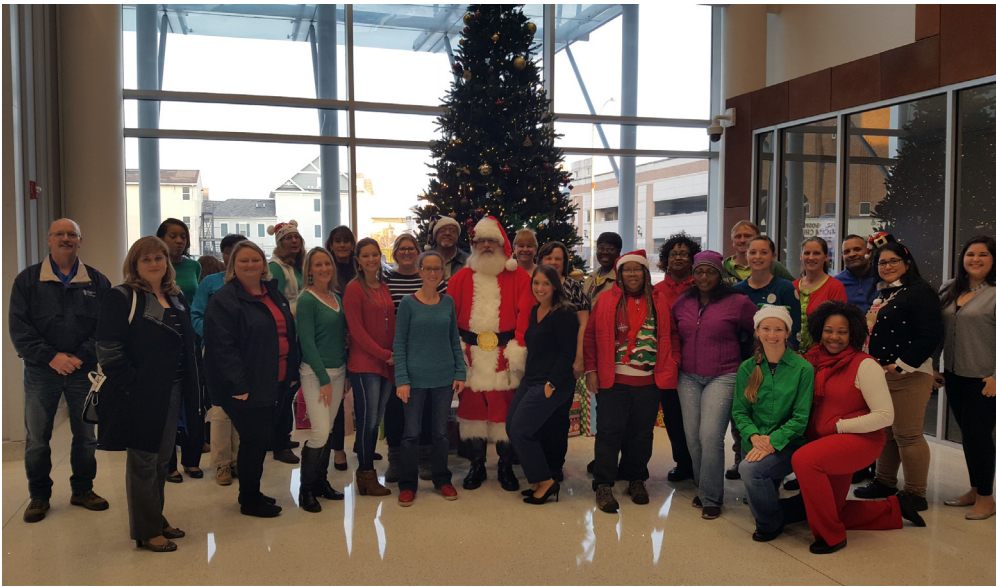
WiSE members and other supporters stand with Santa Claus. sponsored and provided gifts for more than 50 abused and neglected children.