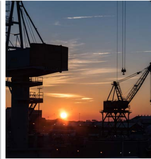
The sun rises over Newport News Shipbuilding.

McNair was among the NNS volunteers who read to students in kindergarten through third grade. "It was very exciting. I like working with kids and helping to inspire them. I like seeing their thoughts and how they react to information," she said. "I wanted to send the message that we're all different. We all have unique talents, and we can all do great things when we grow up."