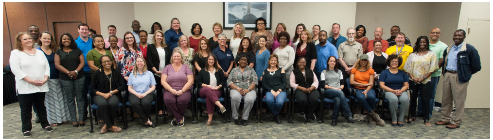
NNS' 2017 United Way campaign coordinators following the informational meeting Oct. 12.

Support from shipbuilders is critical to United Way and its partner agencies, according to