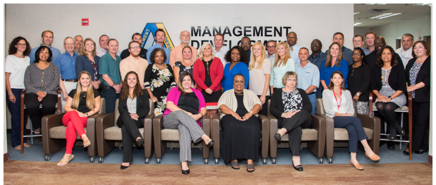
Members of Cohort 2 of Phase III of the Buyer Certification Program.

"The Buyer Certification Program was established to ensure that our procurement professionals are prepared to successfully achieve our company's business objectives