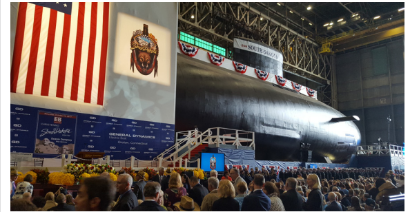
South Dakota (SSN 790), the 17th Virginia -class submarine, was christened Saturday in Connecticut.