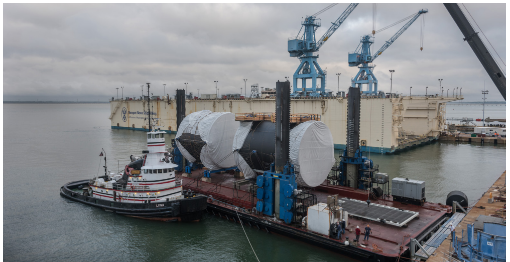
The Reactor Compartment Forward (RCF) module for USS San Francisco (SSN 711) arrived at NNS by sea barge in September.

NNS' role in the ship conversion involves the Reactor Compartment Forward (RCF) module. Manufactured by General Dynamics Electric Boat, the RCF module arrived at NNS in September. Shipbuilders in the Virginia -Class Submarine (VCS) Program will spend the next seven months outfitting the module. The work includes welding the side passageway to the hull,