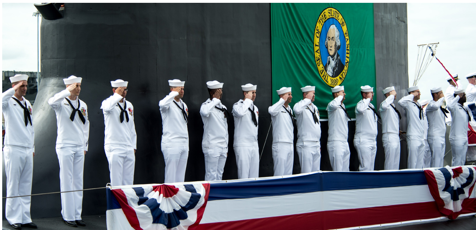
Sailors man USS Washington (SSN 787) during the ship's commissioning ceremony on Saturday, Oct. 7.

2004 Cub Cadet 54" Riding Lawn Mower - GT2054. $700. (757) 778-3943