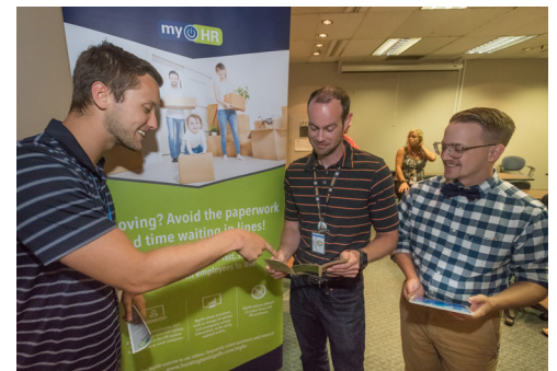
Shipbuilders attend a pop-up session to learn about new MyHR features.