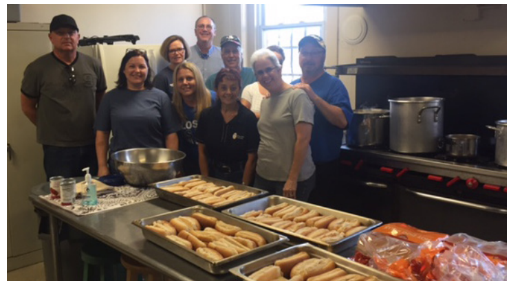
VCS shipbuilders volunteer at the Good Friday Soup Kitchen in Newport News.

"It is rewarding to walk away from serving these folks knowing they are leaving with a warm meal to get them through the night," she said. "Adopting the night from the Jaycees allows them to spread