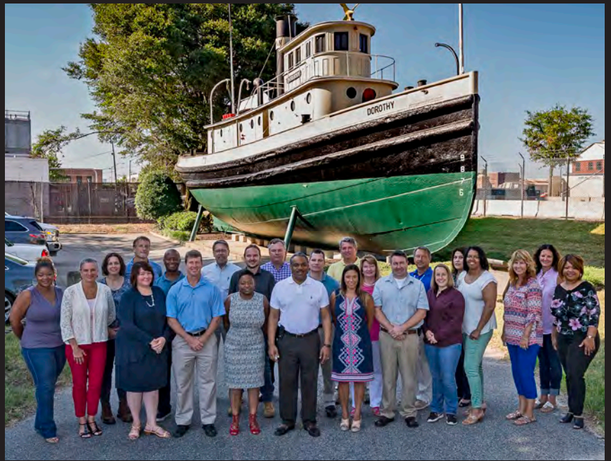
NNS Business Conduct Committee and Compliance Advocates.

"As a team, we continue to seek opportunities to communicate and provide awareness to our