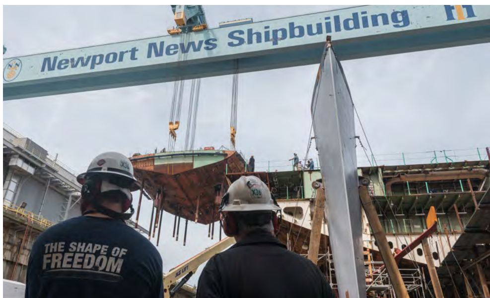
Cover photo: John F. Kennedy's (CVN 79) 932-metric ton lower stern was lifted into place June 22. Pictured above: Shipbuilders watch as Kennedy's lower stern is lifted into dry dock.