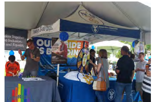
Attendees visit NNS' tent at Hampton Roads PrideFest on Saturday, June 17.