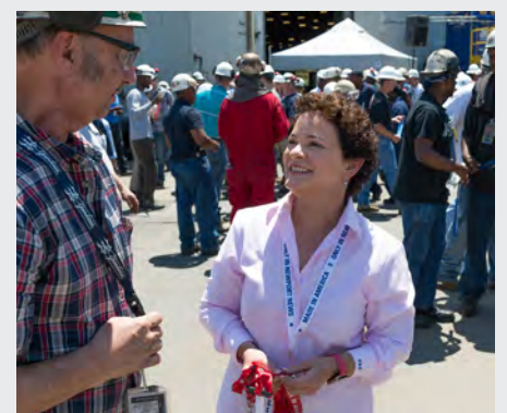
Employee Town Halls Commence READ PG 2