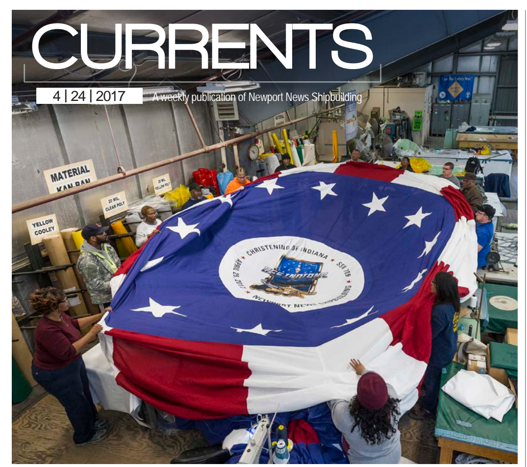
Sail Loft Shipbuilders finalize Indiana 's (SSN 789) bow flag. The flag will be placed over the submarine's bow unit during the christening ceremony this Saturday.