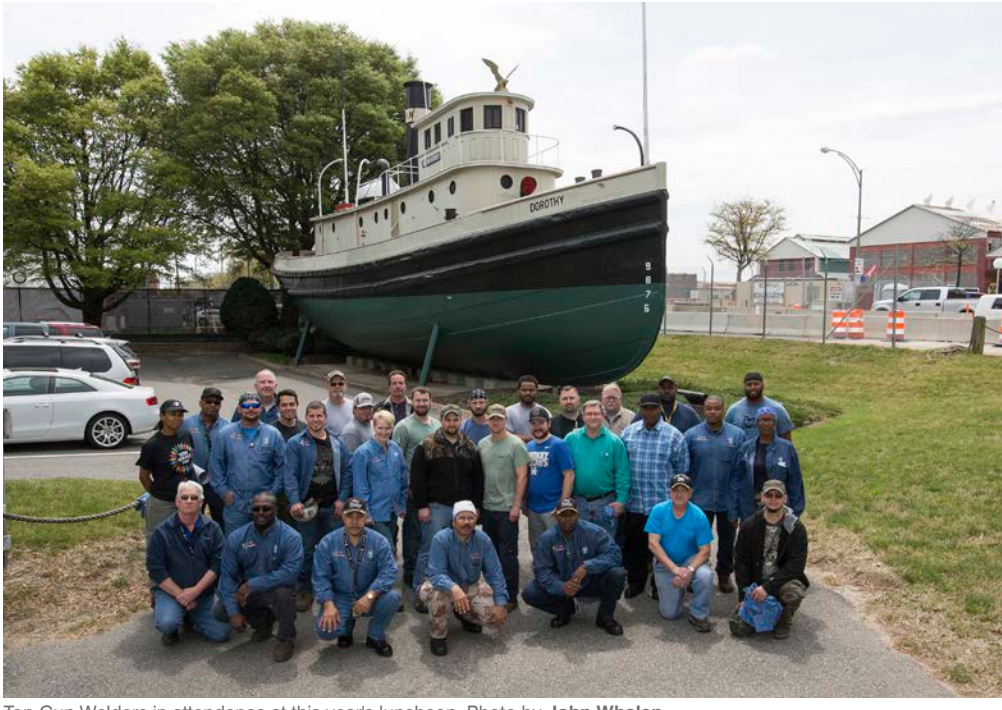
Top Gun Welders in attendance at this year's luncheon.

Of the 29 "Top Gun" welders, five were new inductees and three received plaques for being recognized as "Top Guns" for five consecutive