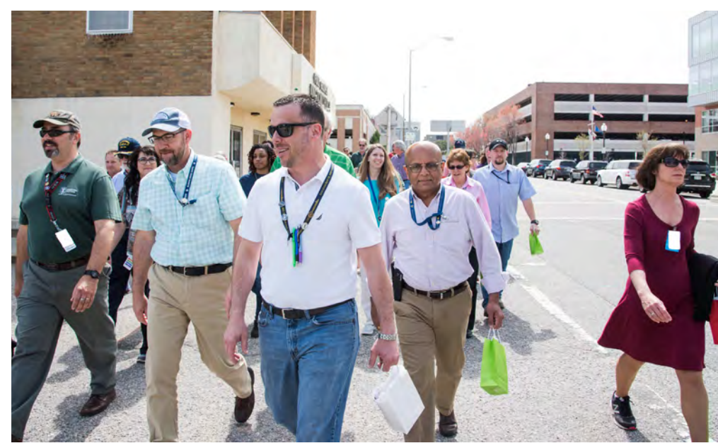
NNS employees participate in National Walking Day April 5.

Interactive Health representatives were available at each location to hand out