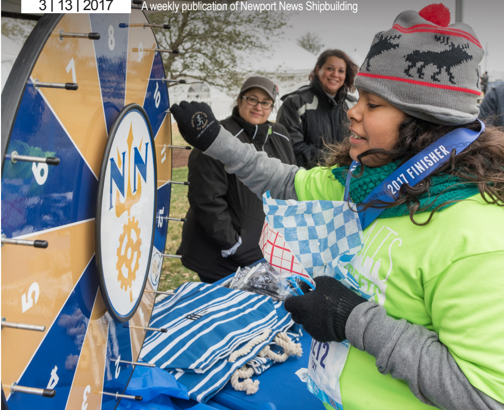
One City Marathon participant spins the wheel for a chance to win a prize at the NNS tent following race events March 12.

A weekly publication of Newport News Shipbuilding