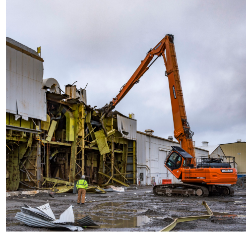
Work is underway to demolish Newport News Shipbuilding's full-scale propulsion plant mock-up.

The four-story, 100,000-square-foot building will be located off-site near 30th Street and Jefferson Avenue. The top three floors will host about 600 NNS engineers, designers and planners who will use new technologies to help revolutionize the company's future, according to Boykin.