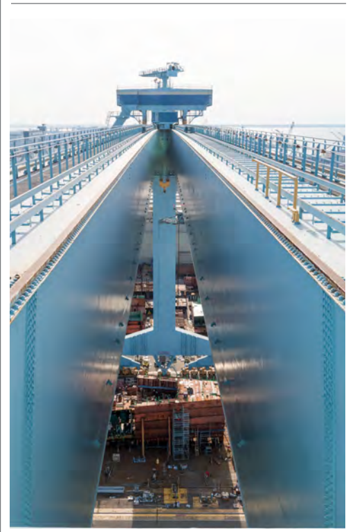
"Big Blue" offers a unique view of John. F. Kennedy (CVN 79) units on the final assembly platen.