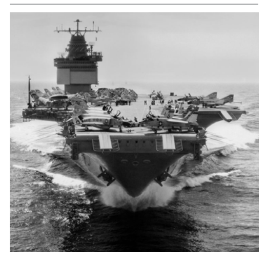
USS Enterprise (CVN 65), with original island configuration during her first deployment in August 1962.

Pictured on front: NNS Shipbuilders joined leaders from four Navy shipyards to share best practices that drive future shipbuilding innovations.