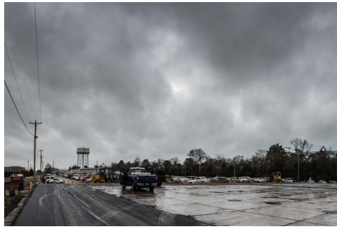
Work is underway to add hundreds of new parking spaces at the Hidens Parking Lot.

As announced in the Jan. 16 edition of Currents , Facilities crews continue to work to add 500 spaces to the Hidens Parking Lot, located off Warwick Boulevard. Currently, 150 of the 500 spaces are available for employee use. As additional spaces become available throughout the construction period, updates will be communicated to employees via Currents , the NNS to Go app and MyNNS. All 500 spaces will be complete by the end of March.