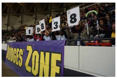
Shipbuilders served as guest judges at Monster Jam events Jan. 20 - 22.