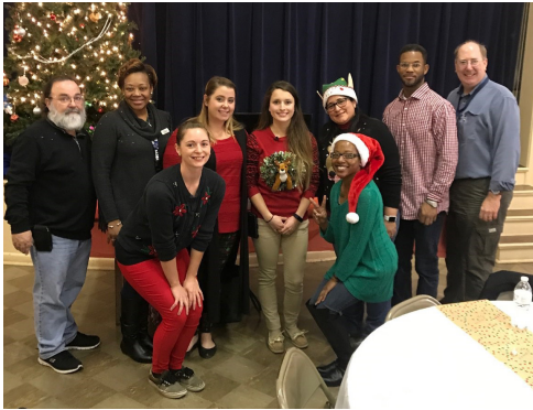
The Plant Engineering Department (O41) partnered with a nonprofit group that is working to reduce poverty.