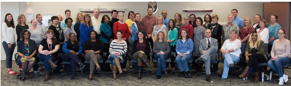
NNS' United Way coordinators are pictured following an appreciation luncheon.

With a new year and a new safety improvement goal, the CVN 79 Program plans to continue to identify employees that are stepping up and making a difference in their work areas to keep shipbuilders safe.