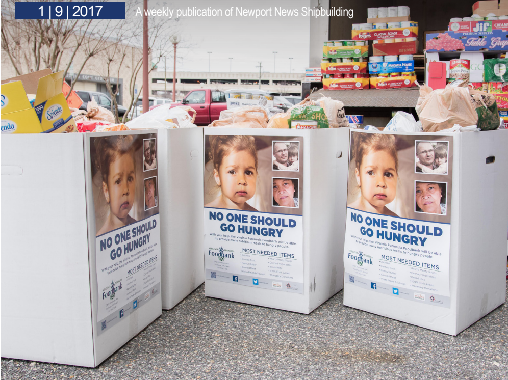
On Dec. 16, 2016 canned goods were collected outside of Bldg. 903 to support the NNS Holiday Food Drive.

A weekly publication of Newport News Shipbuilding