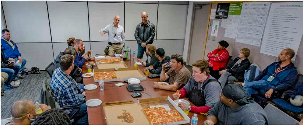
Shipbuilders working on the RCOH of USS George Washington (CVN 73) enjoy a luncheon honoring them for exceptional work.