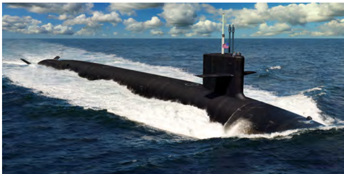
Cover Photo: An artistic rendering of a Columbia-class ballistic missile submarine at sea.

Newport News Shipbuilding Talent Acquisition is now accepting applications for the 2017 Summer Internship program. Internships are available for both NNS and Huntington Ingalls Industries Corporate for college students enrolled in bachelor or master's degree programs in Business, Computer Science, Engineering or Information Technology. To qualify, students must have a minimum 3.0 cumulative GPA. Students will work full-time, 40-hours per week, for a minimum of 10 weeks during the summer months. For more info, search the "Students & New Graduates" section of the HII Careers website for Job/Auto Req ID #15054BR at www.buildyourcareer.com . Applications accepted until February 13, 2017.