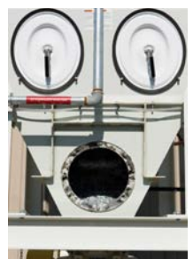
Pictured Right: Machine caught off guard by its portrait.

"Hot Shots" is a collection of photos taken by staff photographers each month at Newport News Shipbuilding. Check out the latest edition on the NNS website.