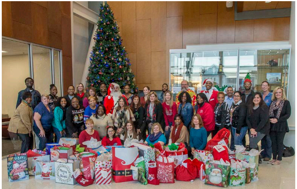
WiSE members and NNS employees pictured in front of the gifts donated to Newport News CASA children this year.