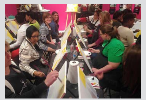
WiSE members paint during end-of-year celebration at Wine and Design in Newport News.