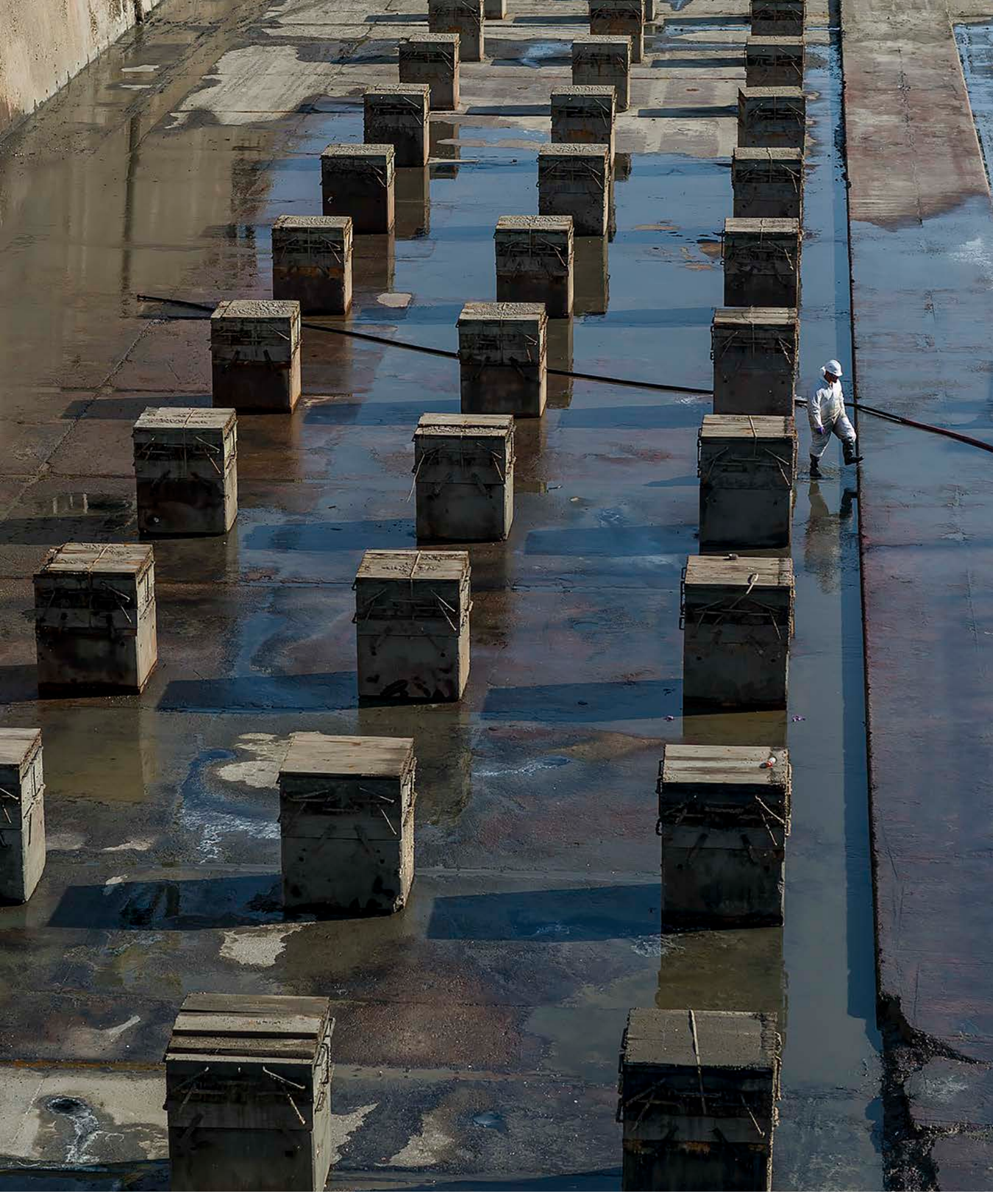
Check Out November "Hot Shots"

View November "Hot Shots" on Yardnet or at nns.huntingtoningalls.com/photos. Pictured above: Keel blocks.