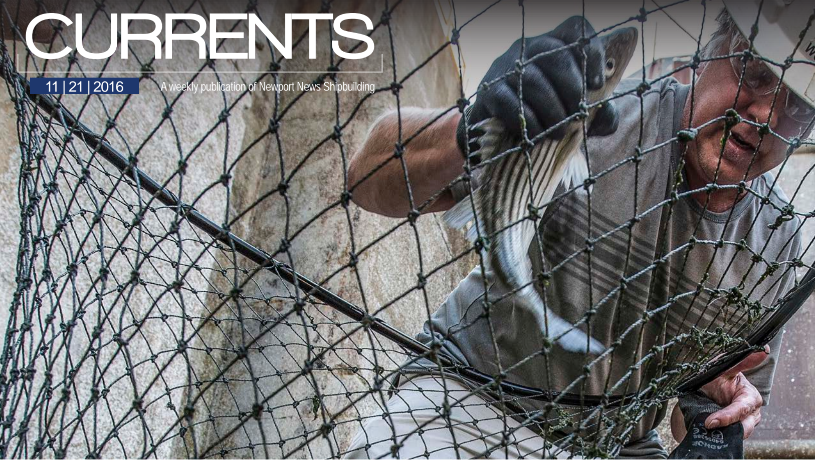
Shipbuilder Thomas Wooten (X36) assists with the fish rescue in Dry Dock 1.