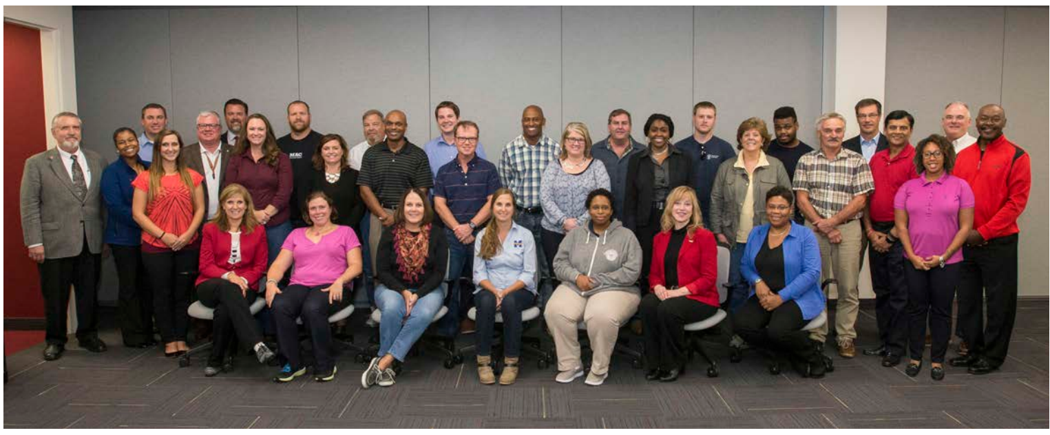
Members of Newport News Shipbuilding's leadership team and the Career Pathways Program hosted school administrators and teachers from area high schools in support of Manufacturing Day, Oct. 7.