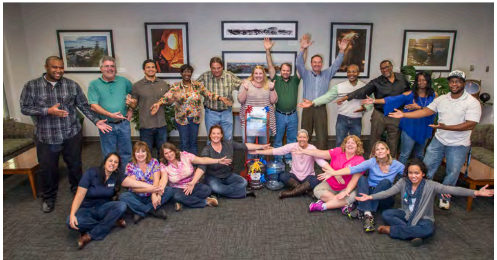
019 employees pose with their "penny jugs" in the lobby of Bldg. 520.

The Progressive Club will host its fourth outing of the year at the Knights of Columbus in Newport News starting at 4:30 p.m. The cost for members' first guest is $20, each additional guest is $25. Notify your club rep by Nov. 11 if you plan to attend. Any salaried employee interested in attending this outing as a trial membership or joining the club should visit the Progressive Club website for more information.