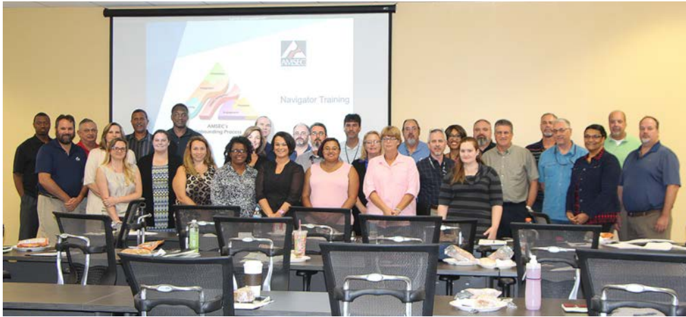
AMSEC LLC Navigators completed the first mandatory training held on Sept. 15.