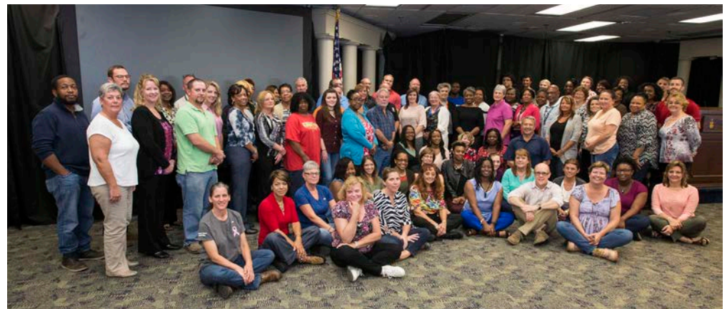
2016 Newport News Shipbuilding United Way department coordinators attended a training session in Bldg. 520 prior to the campaign kicking off.

Employees will be receiving their United Way enrollment guide from their department coordinators with details of how to donate and