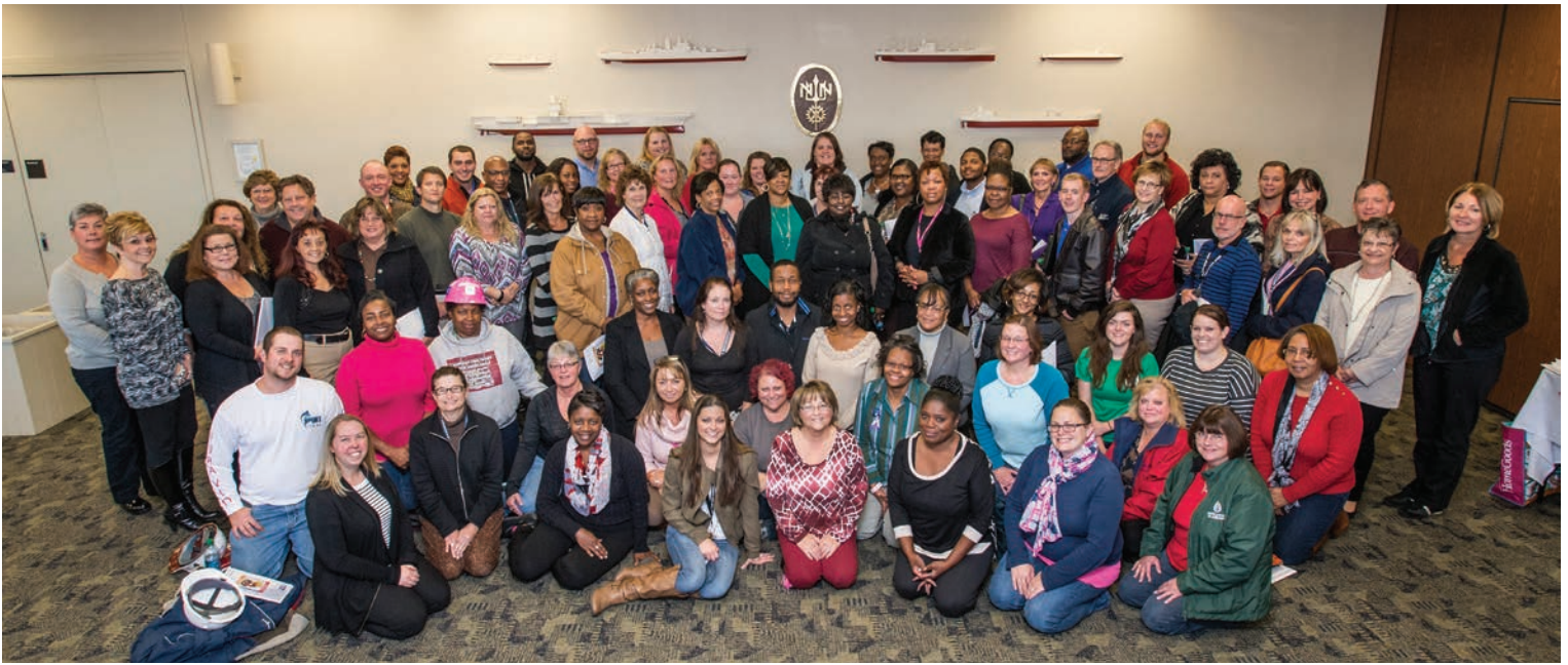
Coordinators for this year's 2015-16 United Way Campaign at Newport News Shipbuilding.