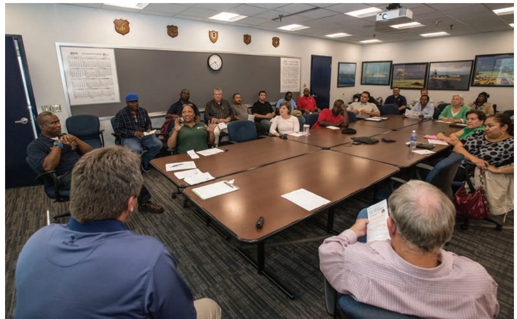
More than 30 employees attended the after work leadercast on Wednesday, Oct. 14.