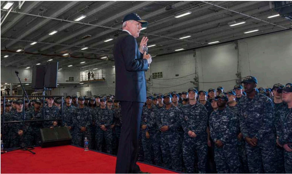
Secretary of the Navy Ray Mabus met with more than 1,000 shipbuilders and sailors to thank them for their hard work on the construction and testing of the aircraft carrier Gerald R. Ford (CVN 78).