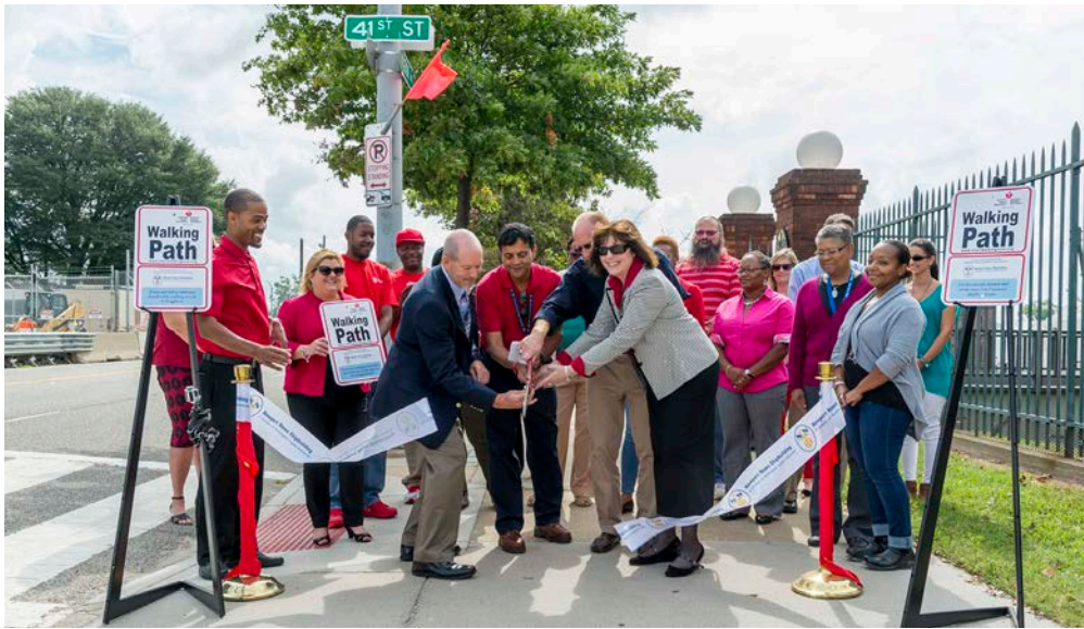
NNS Leaders cut ribbon with NNS employees and representatives from the American Heart Association on Oct. 4.