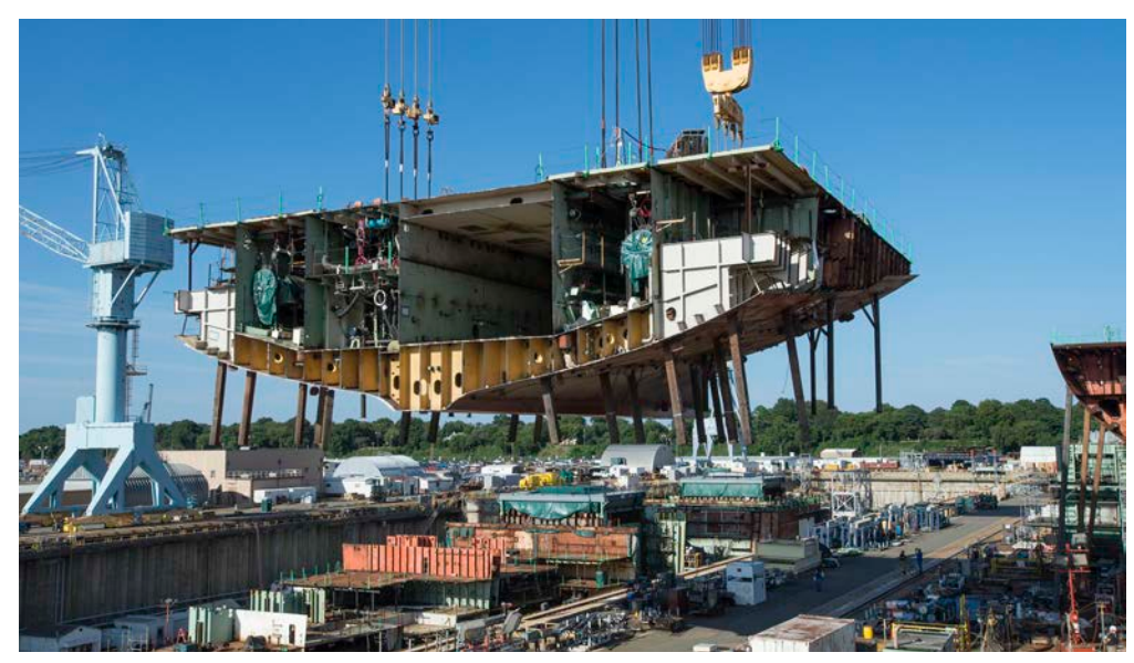
NNS placed a 900-ton superlift into dry dock, continuing construction of the nuclear-powered aircraft carrier John F. Kennedy (CVN 79).