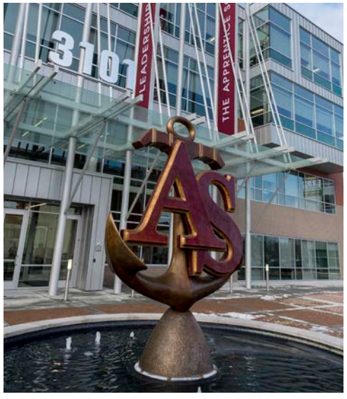
The fountain in front of The Apprentice School at Newport News Shipbuilding.

Hosted by Tidewater Physical Therapy, the "Shipbuilder Strong" Program helps shipbuilders to prevent injuries by teaching shipbuilders how to properly stretch and condition their bodies for the specific job they perform. The exercises are performed before, during and after job tasks, and there are task-specific exercises such as those for climbing, squatting and kneeling. The program also teaches proper lifting techniques to support good back health.