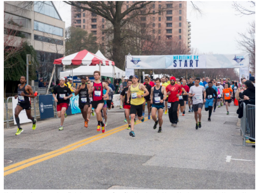
Hundreds of runners take off during the 2016 One City Marathon held on March 13, 2016 in Newport News.

Employees are encouraged to continue to submit ads online at nns.huntingtoningalls.com/currents. As a reminder, all classified ads must be submitted by 4 p.m. each Thursday.