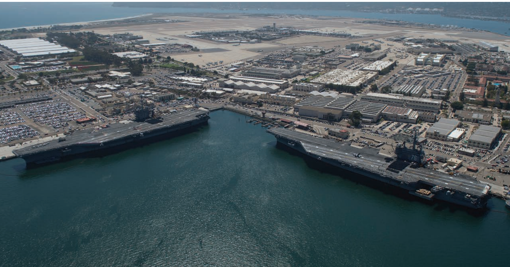
The Nimitz-class aircraft carriers USS George Washington (CVN 73) and USS Ronald Reagan (CVN 76) are pierside at Naval Air Station North Island in San Diego while conducting a hull-swap. The force structure change allows George Washington to undergo its mid-life refueling complex overhaul and Ronald Reagan to support the security and stability of the Indo-Asia-Pacific region. Reagan is scheduled to depart from the island Aug. 31. Washington is scheduled to arrive at Newport News Shipbuilding in 2017 for its refueling and complex overhaul (RCOH).