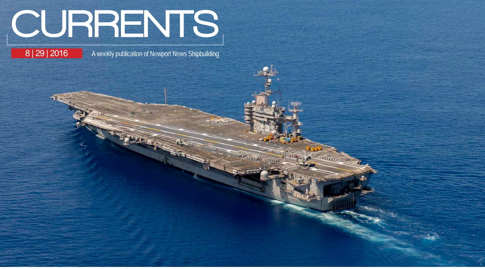
Newport News Shipbuilding received a $52 million contract from the U.S. Navy for work on the aircraft carrier USS Harry S. Truman (CVN 75), shown transiting the Atlantic Ocean in August.