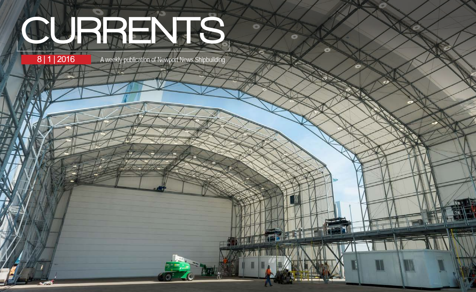
An inside look at the first of two retractable weather covers installed in the North Yard to keep shipbuilders and new carrier construction work out of the elements.