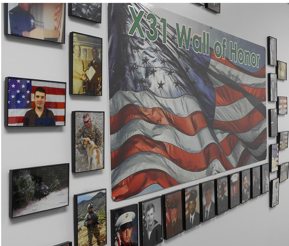
The X31 "Wall of Honor" that is currently displayed at NNS on the second floor of Building 8.