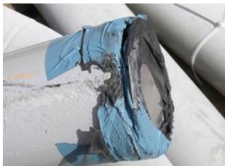
An example of a damaged FMED

Piping systems, components and tanks are protected using foreign material exclusion devices (FMEDs). FMEDs consist of internal plugs, external caps, discs, or blanks, and they are most often installed using approved sealing tape. Under normal conditions, FMEDs remain in place until they are intentionally removed by authorized personnel. However, on occasion FMEDs are inadvertently removed, dislodged or damaged. When this happens, it is very important that loss of cleanliness control be reestablished as soon as possible. This is why every shipbuilder is responsible to keep a watchful eye out for missing, damaged or dislodged FMEDs and to notify an X42 or X43 foreman in the area if they see a cleanliness problem such as the examples shown below.