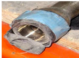
An example of a dislodged FMED