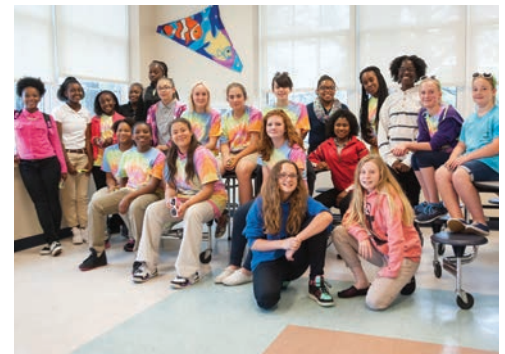
Twenty-eight students from Booker T. Washington Middle School were recognized during the GEMS year-end ceremony June 4.