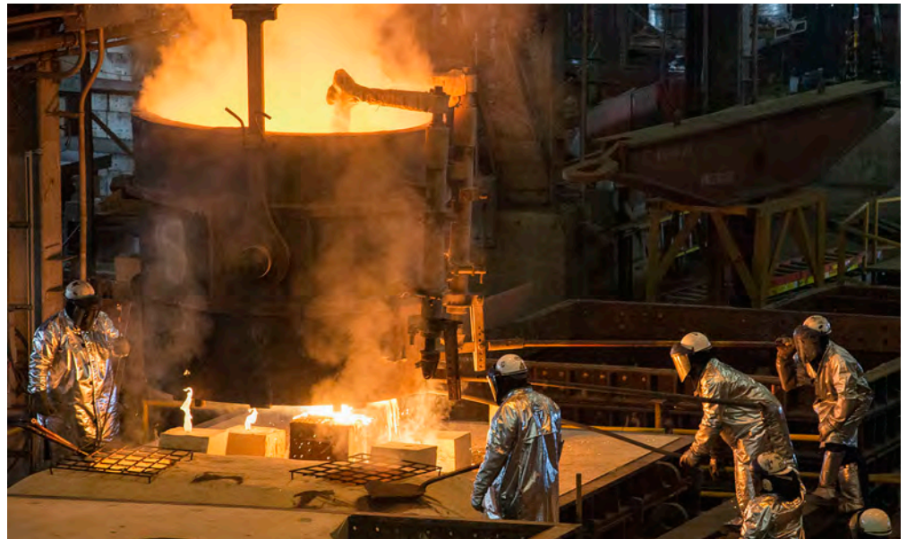
Feel the heat. NNS shipbuilders pour molten steel into a cast, molding a strong arm for a destroyer being built at Ingalls Shipbuilding.

"Hot Shots" is a collection of photos taken each month at Newport News Shipbuilding by staff photographers. Check out the latest edition on the NNS website.