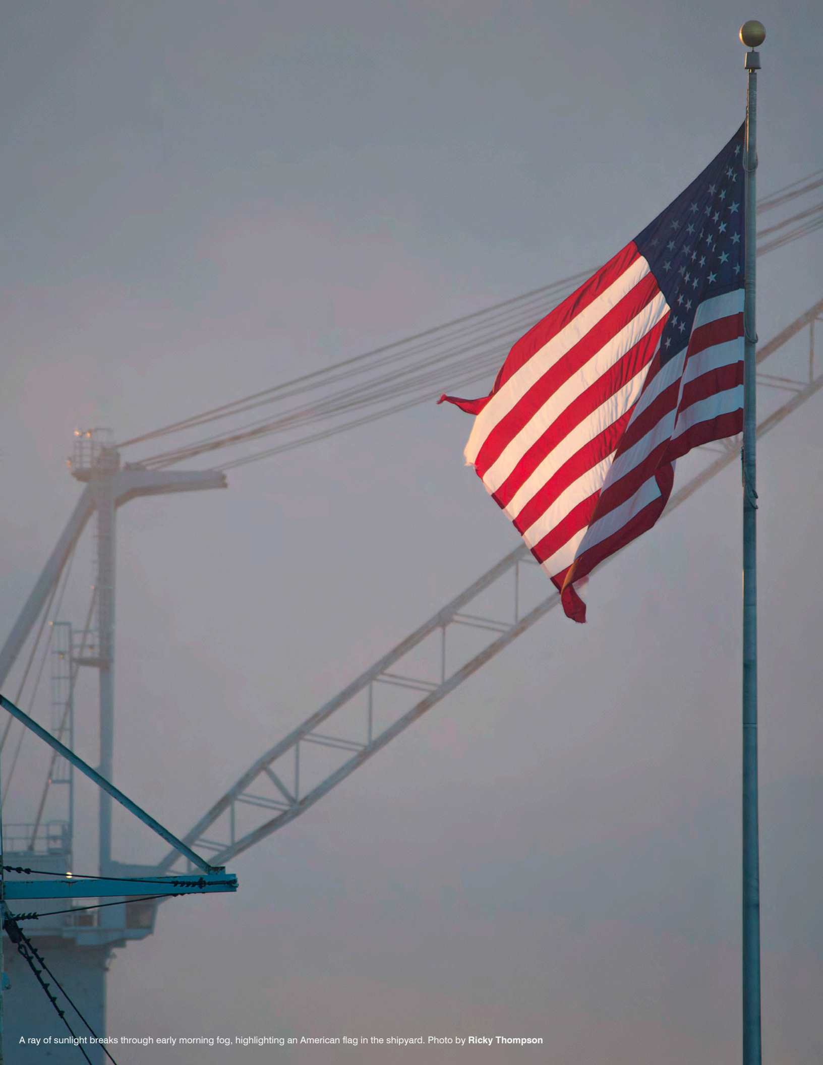
A ray of sunlight breaks through early morning fog, highlighting an American flag in the shipyard.