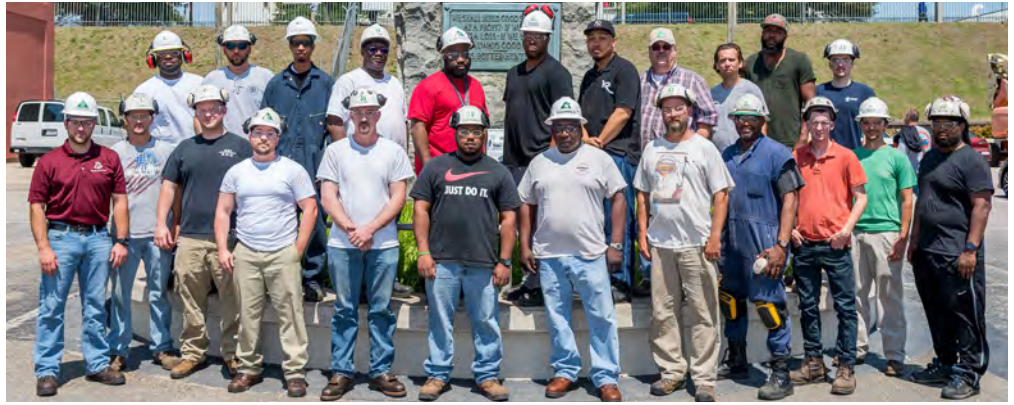
The execution team who helped complete USS John Warner's Lab Array during its Post Shakedown Availability at Newport News Shipbuilding.