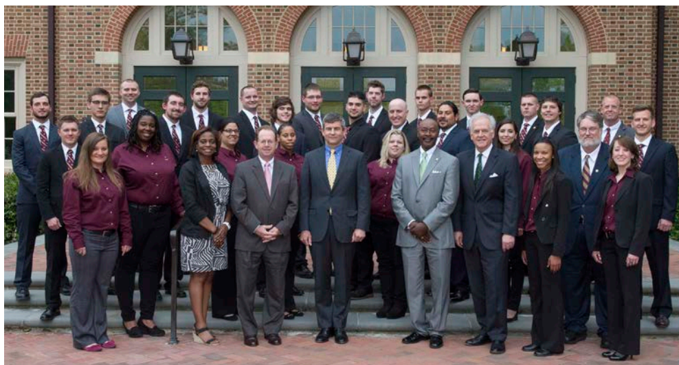
The sixth cohort completes The Apprentice School Leadership Experience at the College of William and Mary.

Shipbuilders have captured thousands of lessons learned in the process of building Gerald R. Ford , most of which are being implemented as cost-saving initiatives in building the second ship in the class, John F. Kennedy (CVN 79). These initiatives will continue on Enterprise , and HII will work with the Navy to identify additional cost-saving initiatives for future Ford -class carrier construction.