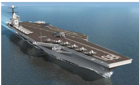
Rendering of Enterprise (CVN 80).