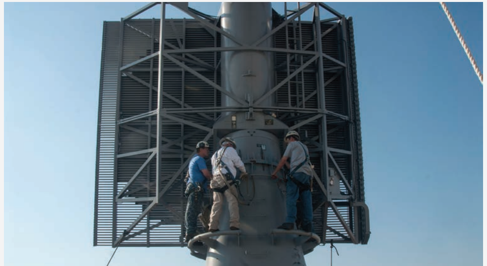
NNS shipbuilders place the SPS-48 air search radar to the top of the Nimitz -class aircraft carrier USS Abraham Lincoln (CVN 72) island on May 6.

The functionality and look of GetThere (EDGE) with regards to booking travel reservations does not change and should still be used for all domestic travel for employees who have a corporate credit card. The welcome email contains a link to the site for employees to create a password and verify that their profile information is accurate. Travelers who require Full Service Desk assistance may contact ADTRAV at 1-855-401-4558. Visit the Travel Website on Homeport for more information about the transition.