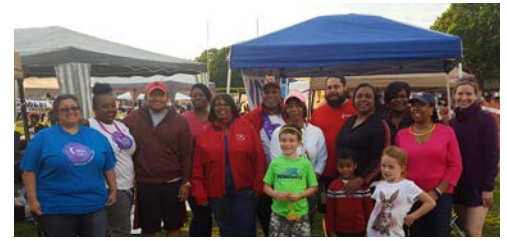
NNS shipbuilders and family members volunteer at the Newport News Relay for Life event on May 7.

The " Control of Personally-Owned Camera-Enabled Devices " policy is available for viewing in Command Media on Yardnet.