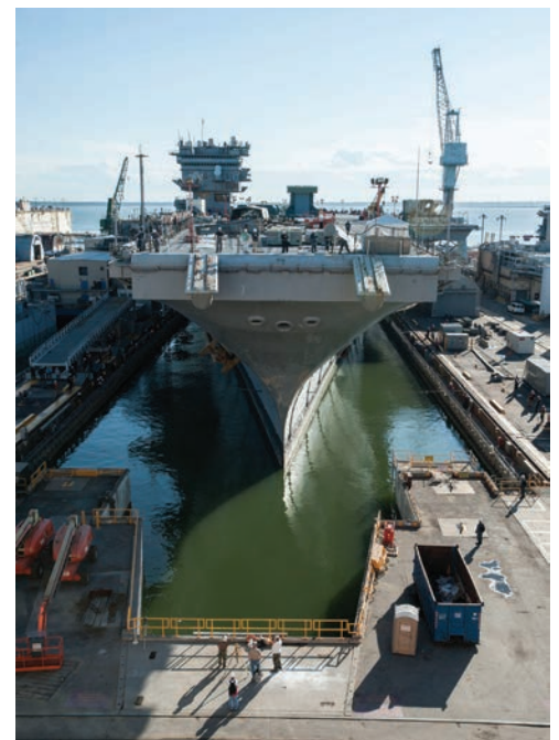
USS Enterprise is escorted by six tugboats into Dry Dock 11, the carrier's original birthplace. Enterprise is the first nuclear aircraft carrier to undergo an inactivation, which includes defueling the ship's eight reactors and preparing the hull for its final dismantlement.