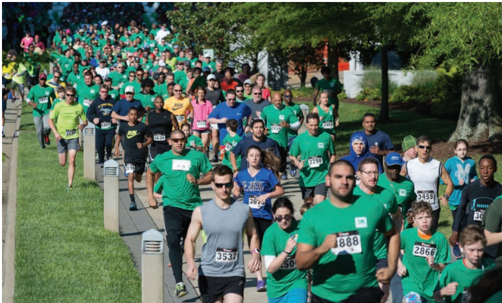
NNS 5K participants began the run/walk at Victory Landing Park beside VASCIC on Saturday, May 2.