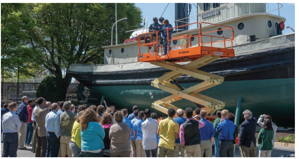
Representatives from NNS' Career Pathways team dropped each team's egg onto asphalt. Points were awarded to teams based on egg integrity after the drop, cost of materials and presentationes.

Visit www.hiibenefits.com to elect coverage or make changes to plans. For questions about benefits options or how to enroll, contact the Huntington Ingalls Industries Benefits Center at 1-877-216-3222.