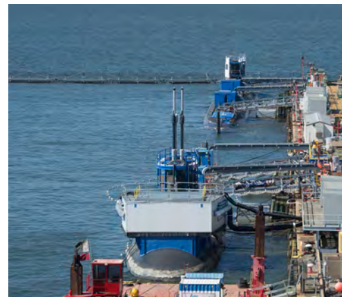
John Warner (SSN 785) and Washington (SSN 787) line up at pier 6. This is the first time two Virginia-class submarines have been together at the pier.

When the policy changes, all employees will be notified. Until then, employees are encouraged to view frequently asked questions (FAQs) about the policy on Yardnet. Additional information about the policy change will be communicated to employees prior to May 2.