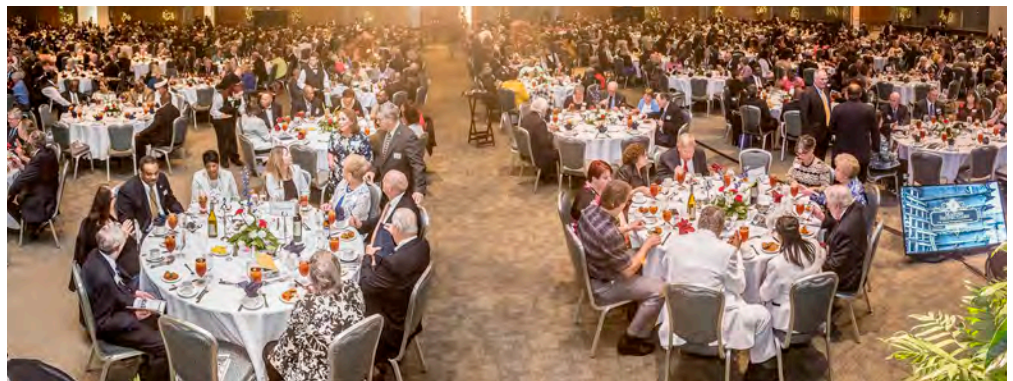
Master Shipbuilders Dinner at the Hampton Roads Convention Center in Hampton on April 21.

View the keynote address and highlights videos of the Master Shipbuilder Dinner on Yardnet .