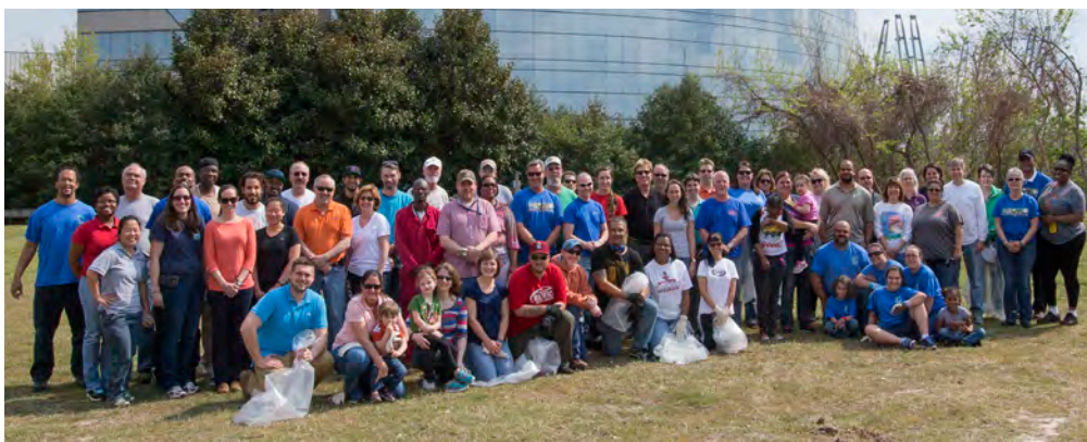
NNS Earth Day volunteers on April 21.

To learn more about Newport News Shipbuilding blood drives contact Judy Fundak (K18) at 380-3011.