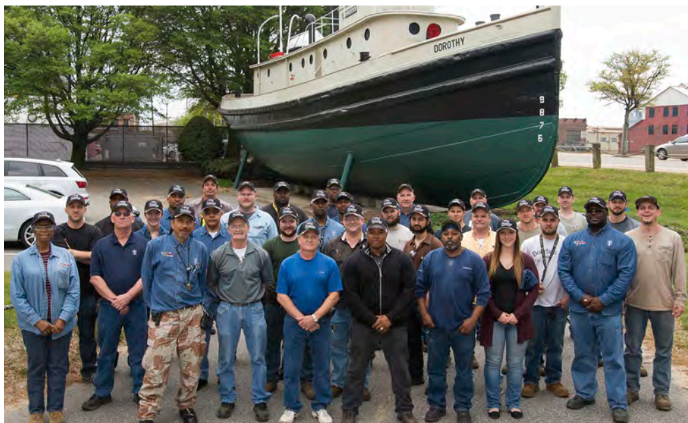
“Top Gun” welders recognized on April 22.