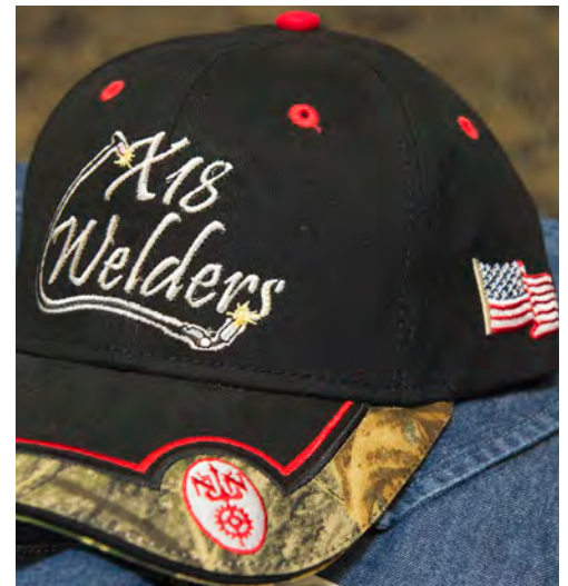
Special hat given out during the "Top Gun" welders recognition luncheon.