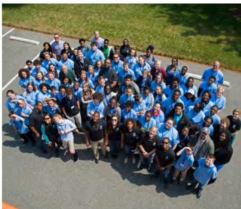
Newport News Public School students and volunteers pose for a photo following the 5th annual Egg Drop Competition at NNS April 21.