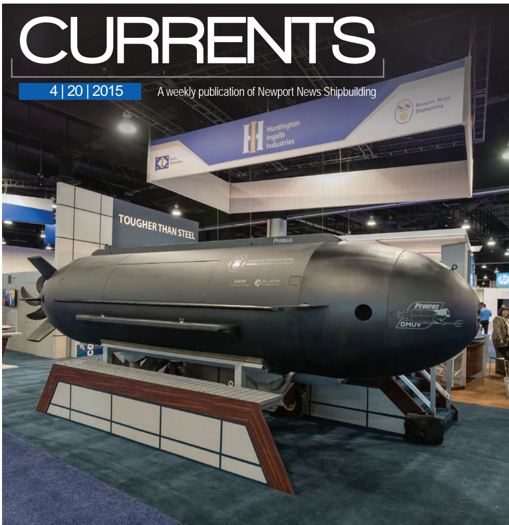
Proteus on display at the HII Booth at Sea-Air-Space April 13-15.

A weekly publication of Newport News Shipbuilding