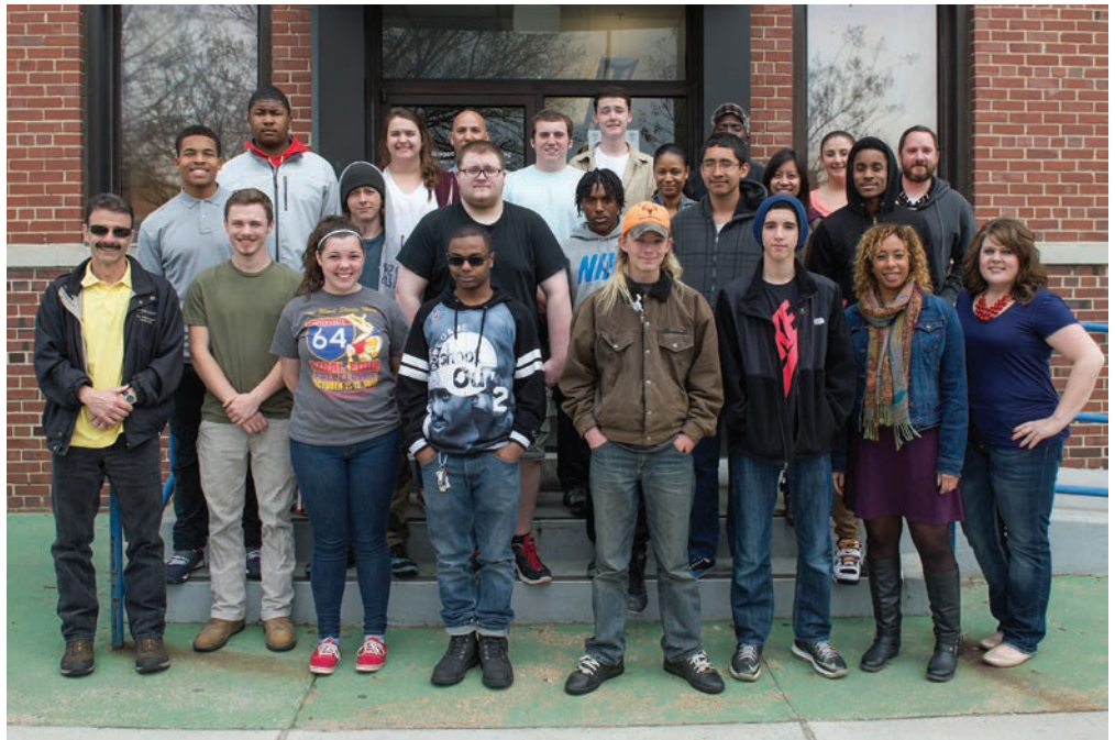
Area students came to NNS April 7-9 as part of their Spring Break “Make It Work” Program.

“This was a great learning opportunity that I did not want to pass up and it has opened my eyes