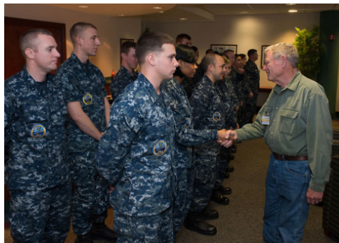
Sen. James M. Inhofe (R-Okla.) met with sailors from Oklahoma serving aboard CVN 72 and CVN 78 for breakfast April 17.