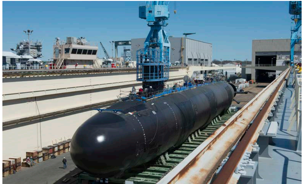
Shipbuilders rollout Washington (SSN 787) into the floating dry dock on March 18.