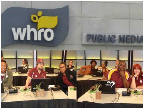
Apprentice Jaycees volunteer at WHRO in Norfolk.