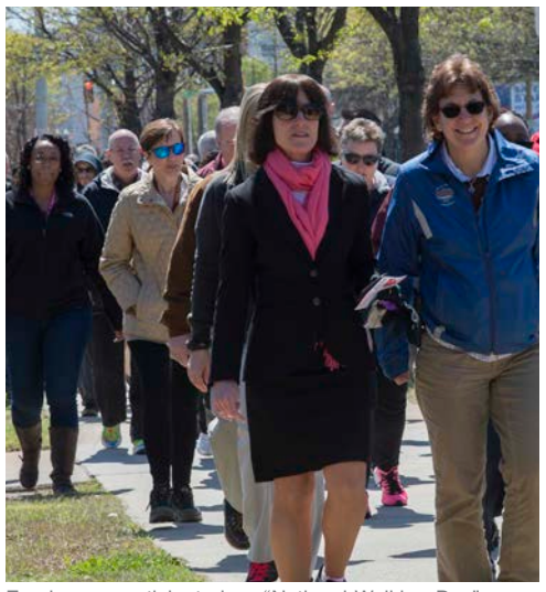
Employees participate in a "National Walking Day" group walk during lunch April 6.

Visit the 130th Anniversary website to watch new congratulatory video messages. New videos are added to the website each week.