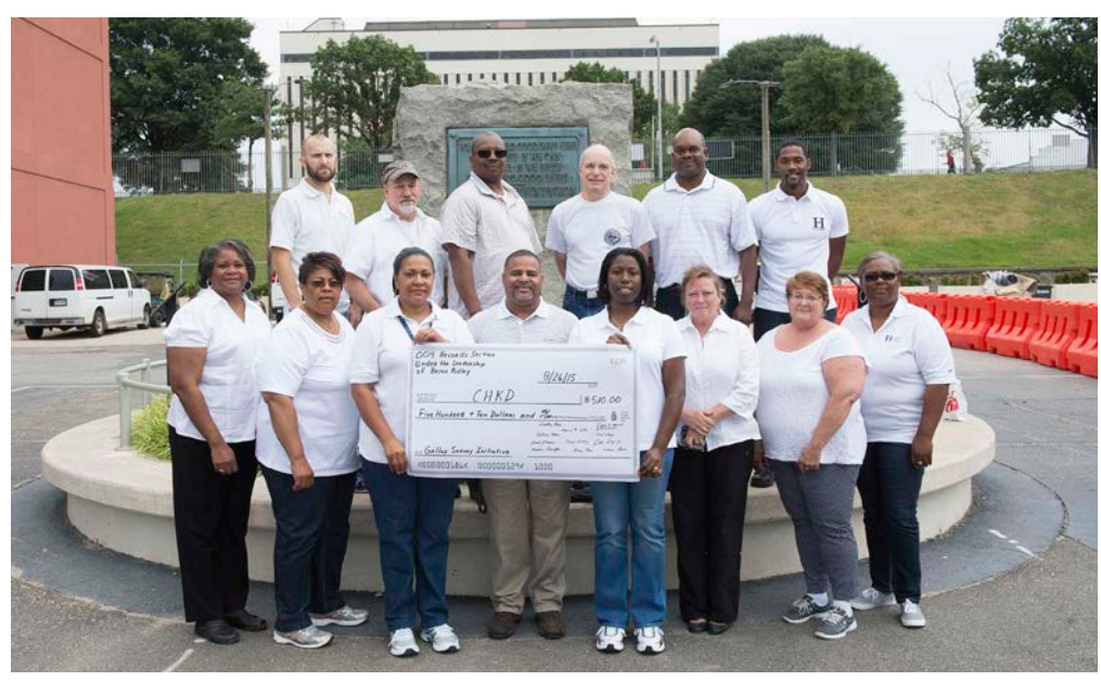
Quality Assurance Records Division (O04) displays a check they donated to CHKD.