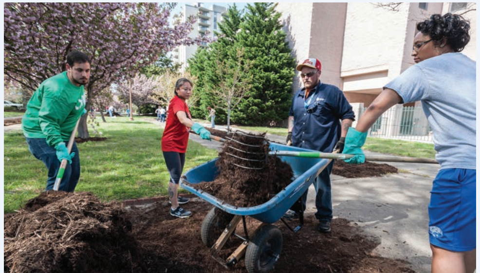
NNS shipbuilders spread mulch during last year's Earth Day Cleanup event.